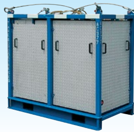
HPS650EC shown with panels and lifting slings