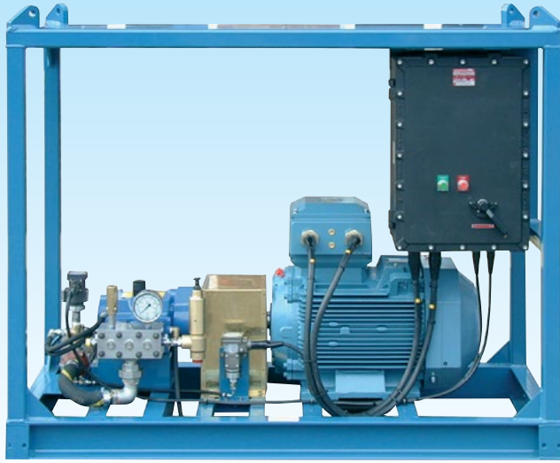
Up rated performance