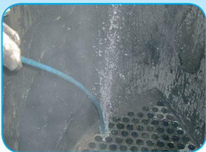
Heat exchanger cleaning - 28 lpm / 800 bar